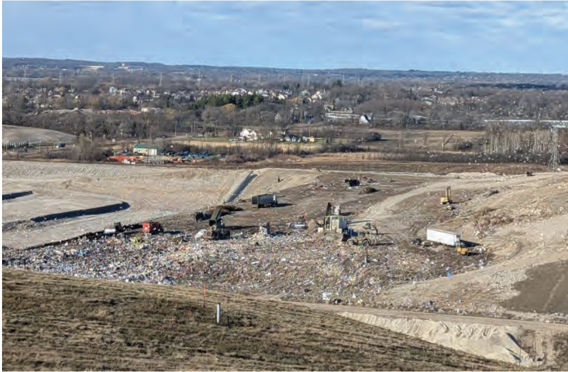
Working face at South end of Phase 3, filling out cell boundaries