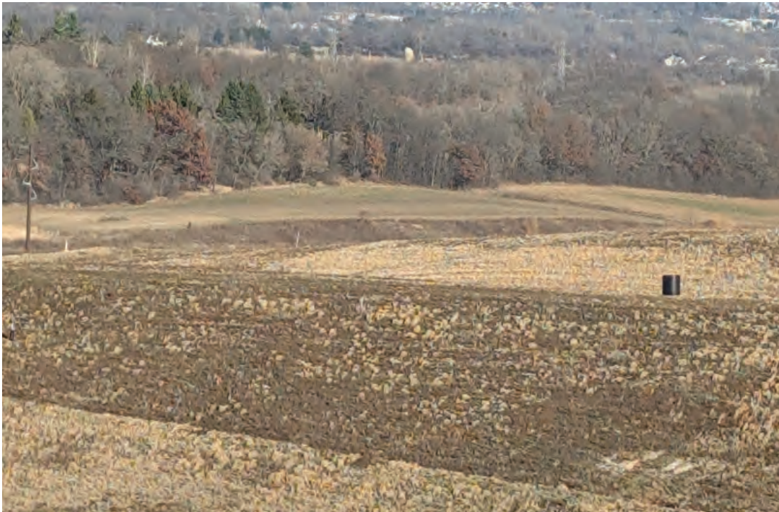
Typical cover condition of Clearwater pond