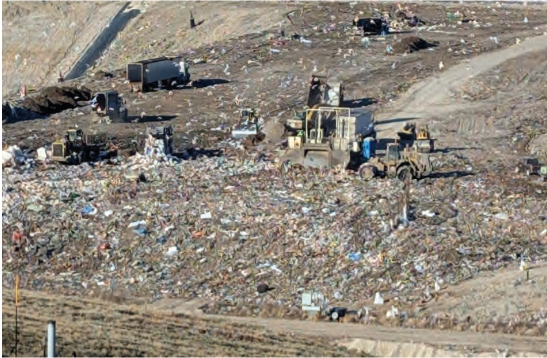
Tipper at very South end of Phase 3