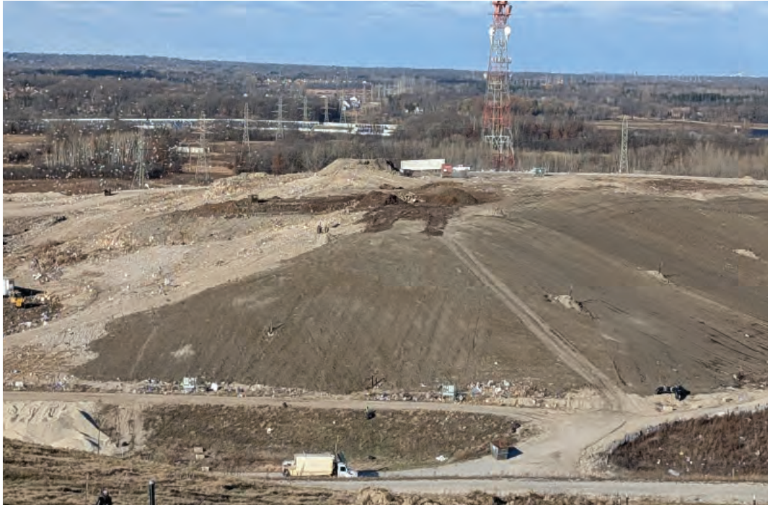
Top soil placement on slopes of North Expansion West, vegetation slow to cover