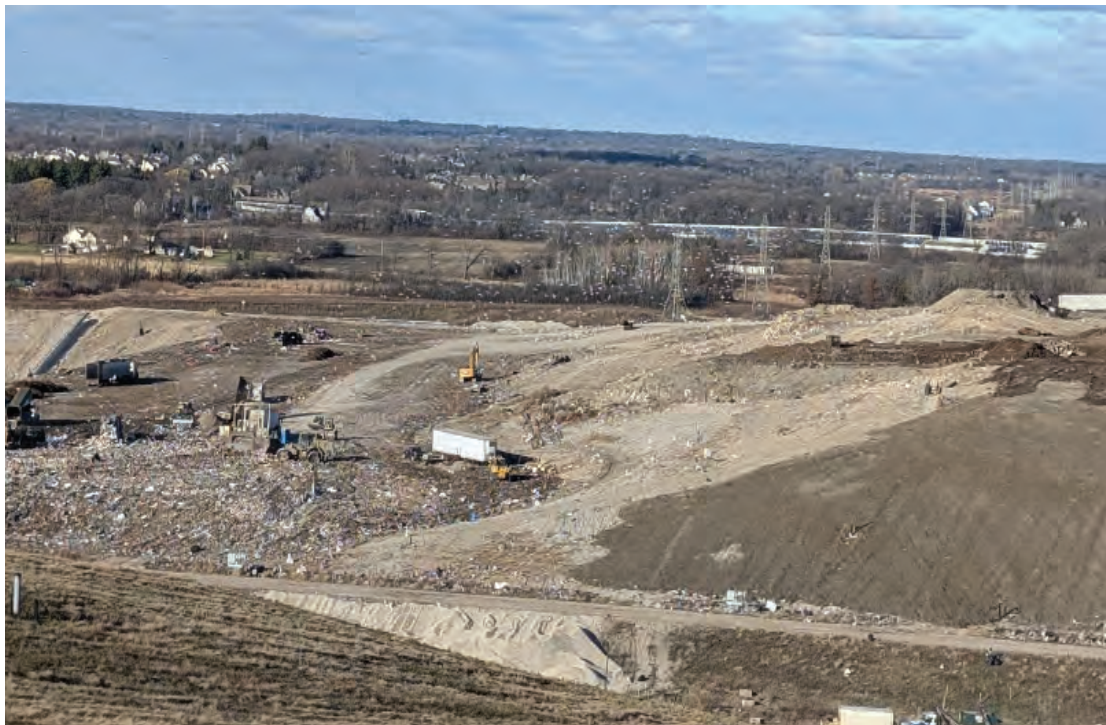
Top soil placement on slopes of North Expansion West, vegetation slow to cover; adjacent working face