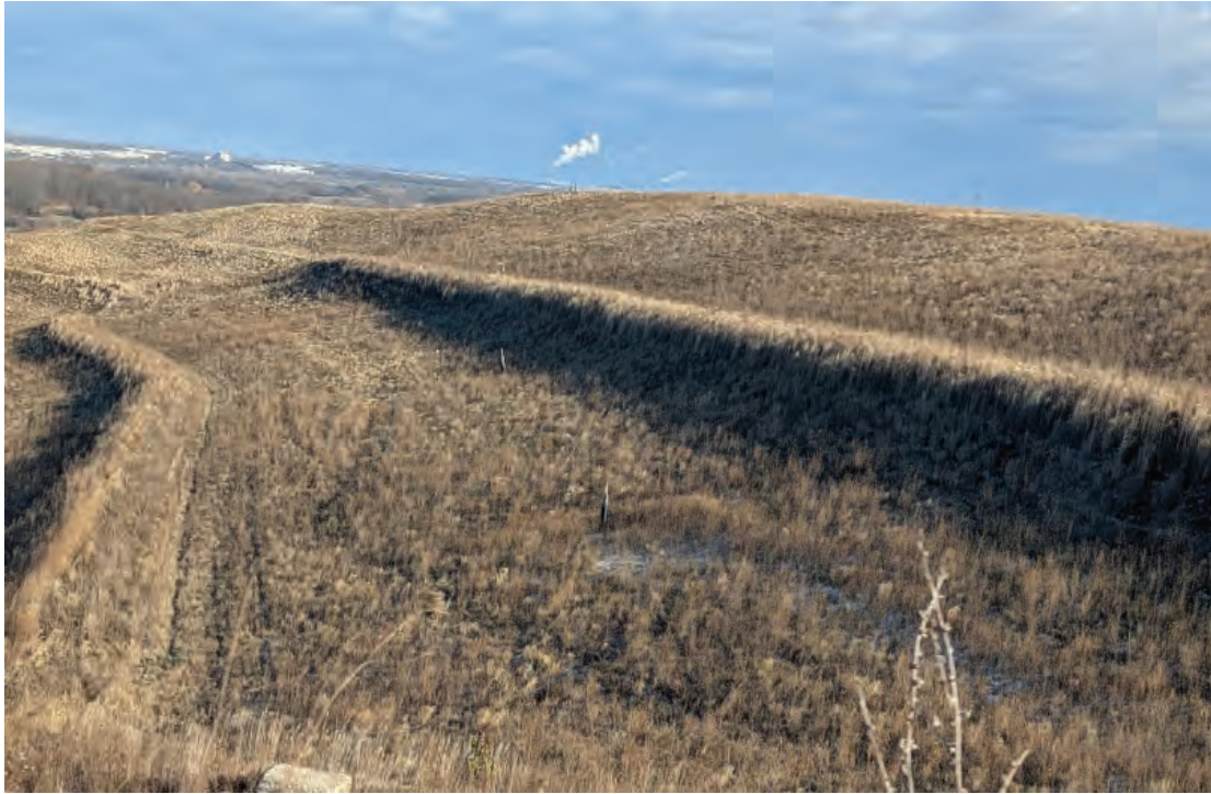
Typical cap condition on Phase 6 & 7