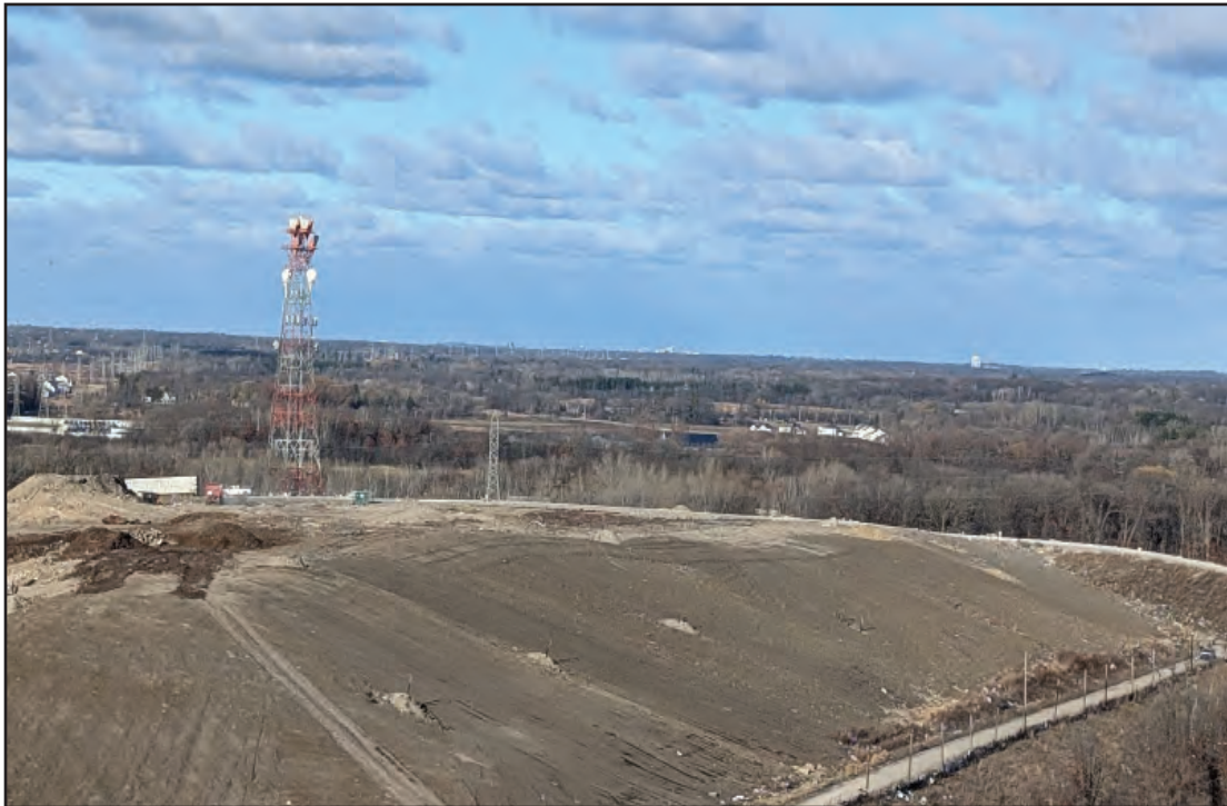
Top soil placement on slopes of North Expansion West, vegetation slow to cover