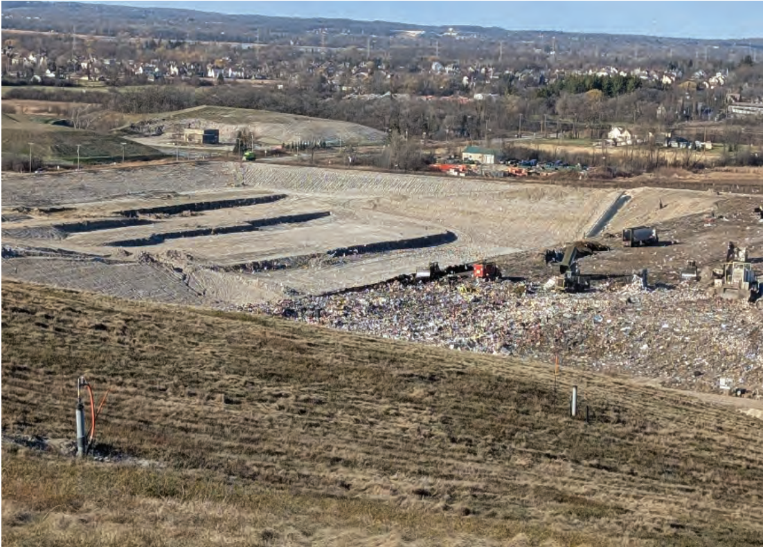
Future cell and current cell 3 in operation