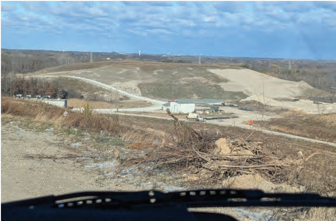
Soil stockpile mostly vegetated for the winter